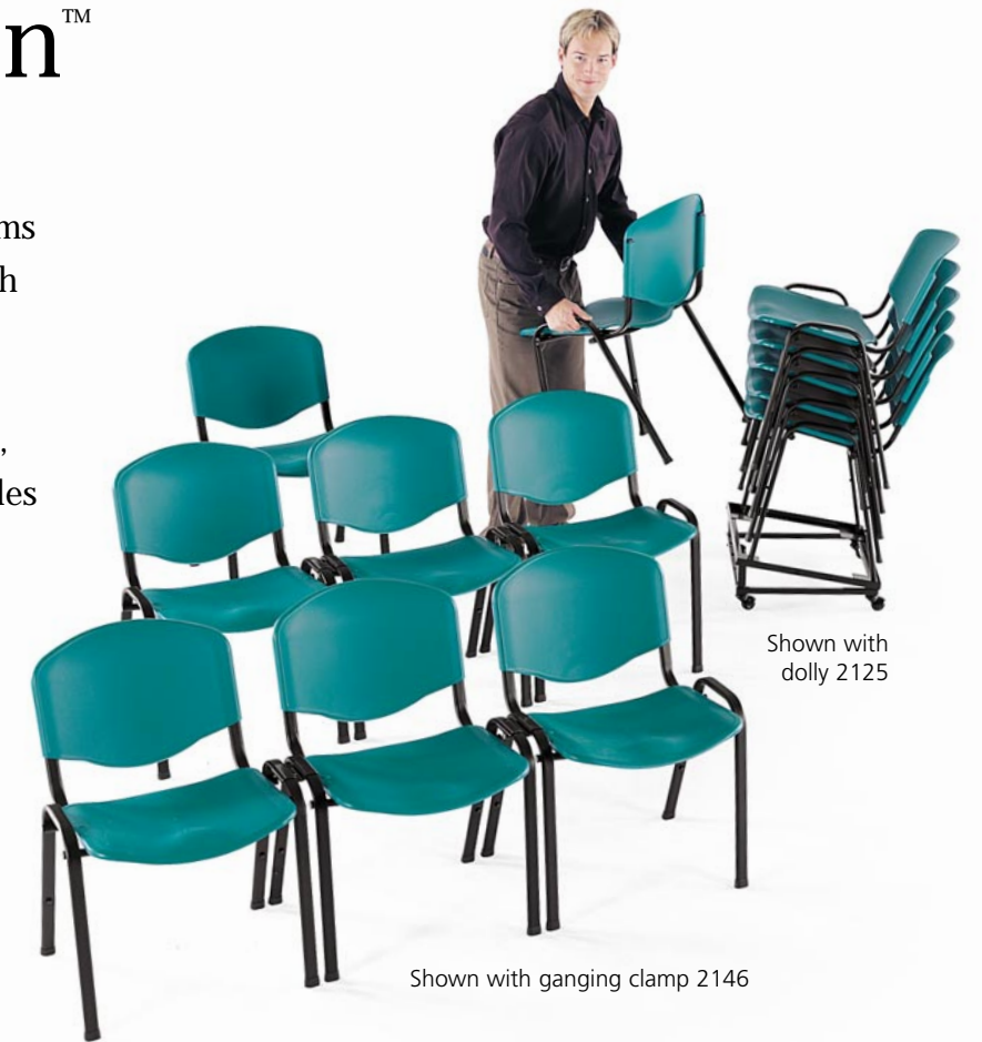
Shown with dolly 2125

Flexon is ideal for casual meeting spaces, lunch rooms and waiting areas. The high impact polypropylene seat and back allow for easy cleaning and the oval tube, epoxy coated frame provides support and durability.