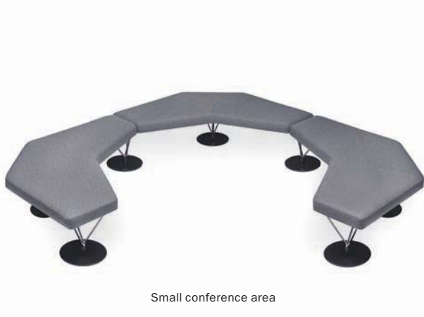
Small conference area