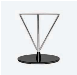
Matte Chrome legs and Onyx base plate