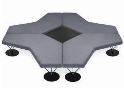
Public space for eight

Comprised of an upholstered bench, connecting tables and a structural steel rod and disc base, Chemistry provides an option for any space.