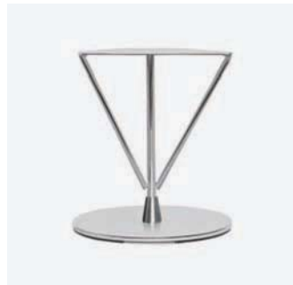
Matte Chrome legs and base plate