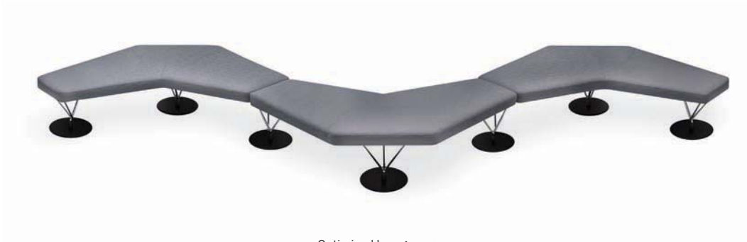
Optimized lounge space