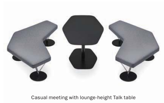
Casual meeting with lounge-height Talk table