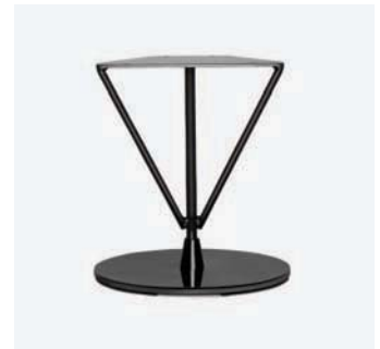
Onyx legs and base plate