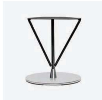
Onyx legs and Matte Chrome base plate