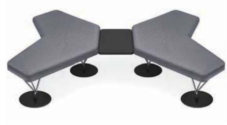
Providing both intimate and private angles