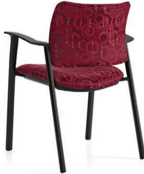
6656 Back View Guest armchair with upholstered back.