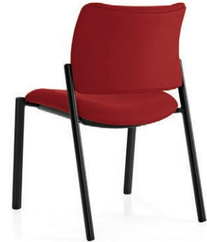
6657 Back View Armless Guest chair with upholstered back.