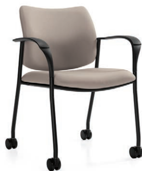
6900C Guest chair with casters shown in Momentum Tate, Helm (09113564) with Black frame (BLK).