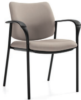
6900 Armchair with upholstered seat shown in Momentum Tate, Helm (09113564) with Black frame (BLK).