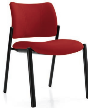
6657 Armless Guest chair shown in Imprint, Candy Apple (IM74) with Black frame (BLK).