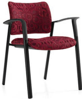
6656 Guest armchair shown in Mayer Disco, Garnet (WC957-001) with Black frame (BLK).