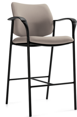
6906 Bar height stools shown in Momentum Tate, Helm (09113564) with Black frame (BLK).