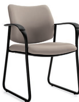
6902 Guest chair with sled base shown in Momentum Tate, Helm (09113564) with Black frame (BLK).