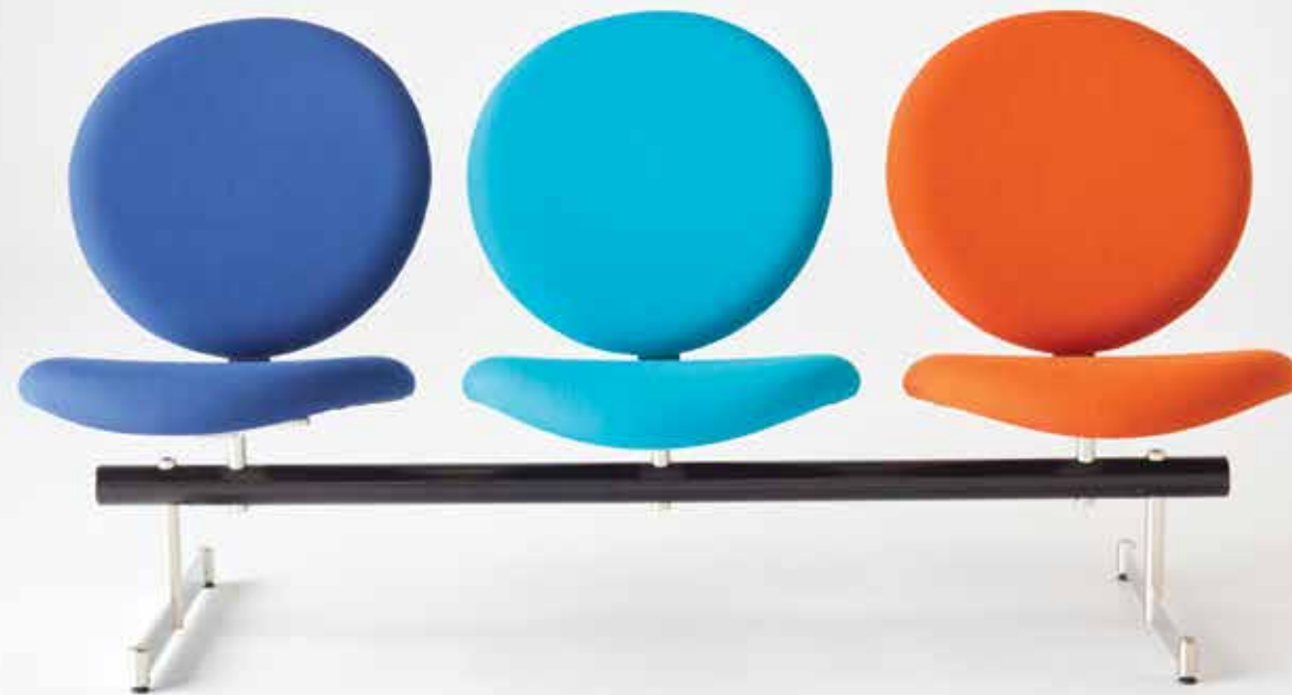
Lollipop Robin Bush 1960