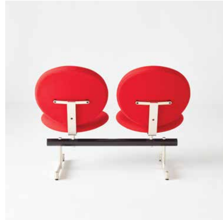
Lollipop Robin Bush 1960